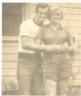
Photographed in 1952