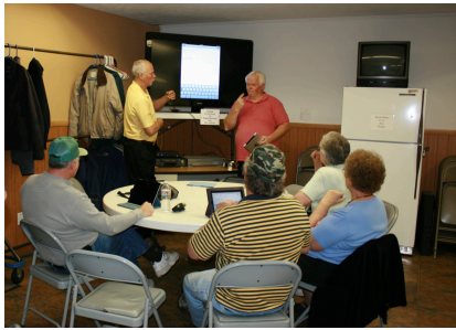
Seniors find the best place to discuss, learn, and chat about the iPad.