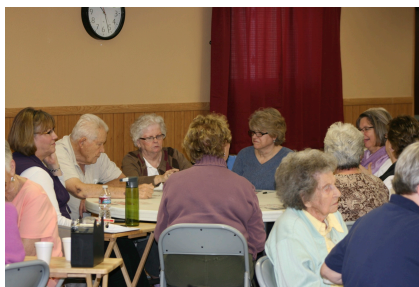
Seniors love playing card games of all types.