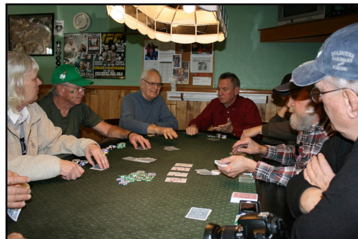
Seniors love to play poker and socialize with fun people.