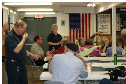
There are many fun activities elderly people can take part in to keep their mind sharp...fun talking and socializing.