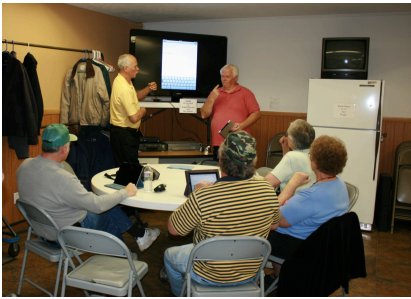
Seniors find the best place to discuss, learn, and chat about the iPad.