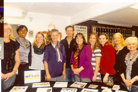
Sprint Denver and Relay Colorado Team